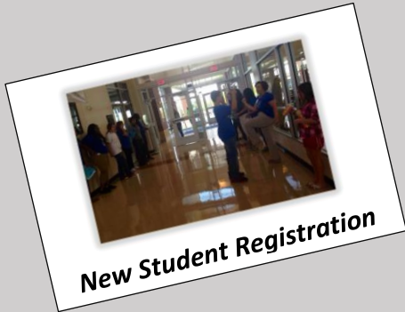
New Student Registration