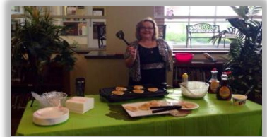
New Student Breakfast