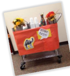
What Day Is It?