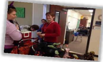
It's Hump Day!